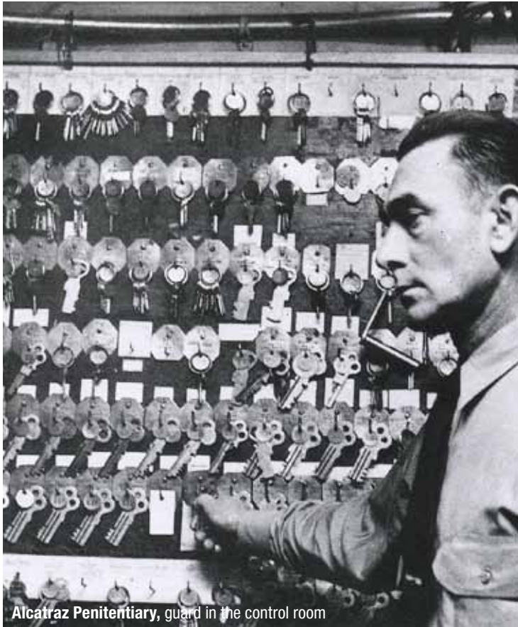
Alcatraz Penitentiary, guard in the control room

two minutes. Four days later three of his friends came up to me while we were working on the road and without a word started kicking me with their work boots. I went down and the pain made me do wild. As it always does. I was working with a short handled shovel and came up off the ground swinging. We all went to the hospital. One of them had a fractured skull and the other two had broken arms. I had to have a hernia operation and had a few other bruised on my head and body.